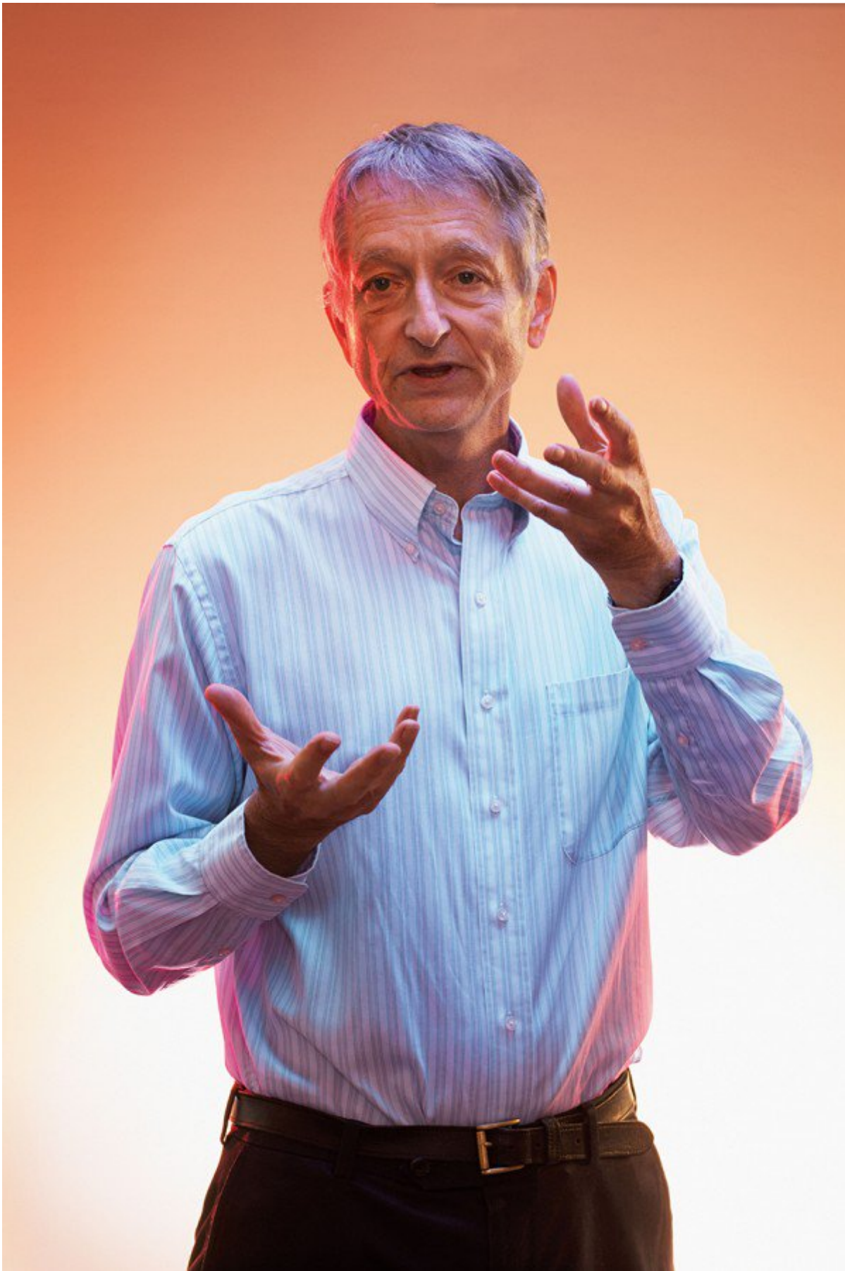
Geoffrey Hinton

It is no coincidence that Toronto's flagship AI research lab is in fact. Hinton was the one who came up with