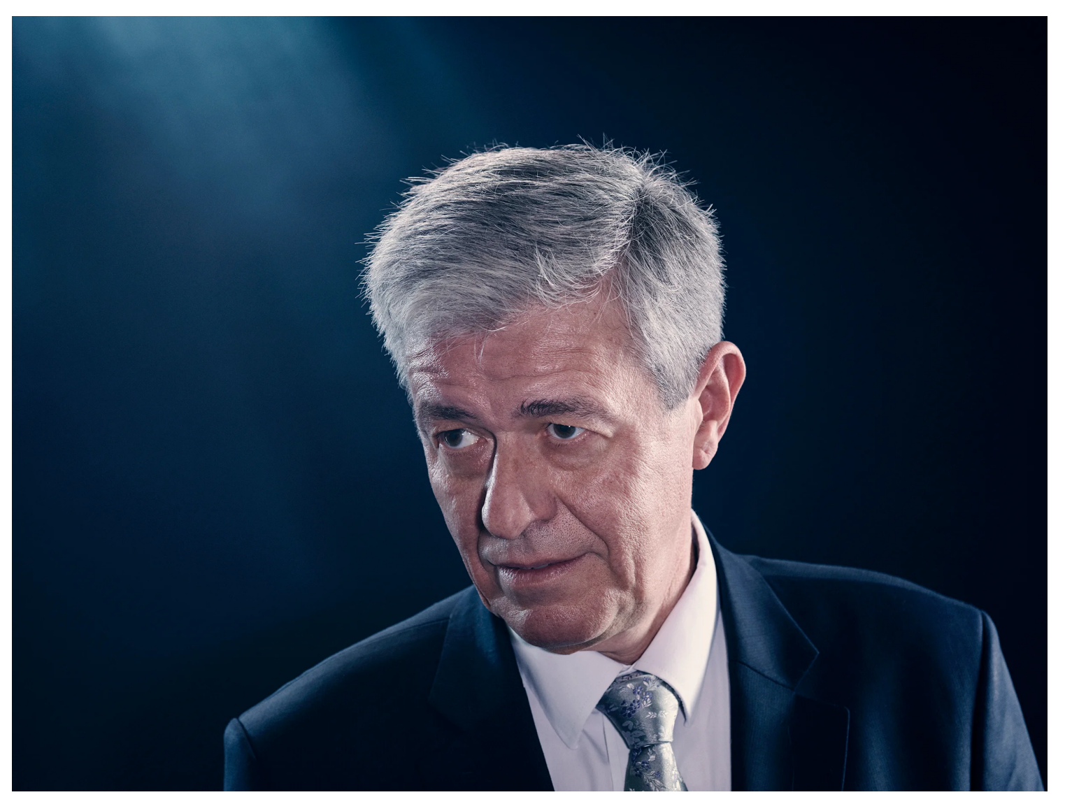
Karl Friston's free energy principle might be the most all-encompassing idea since Charles Darwin's theory of natural selection. But to understand it, you need to peer inside the mind of Friston himself.

Karl Friston's free energy principle might be the most all-encompassing idea since Charles Darwin's theory of natural selection. But to understand it, you need to peer inside the mind of Friston himself.